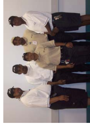
Some of PCA's Meal Delivery Staff