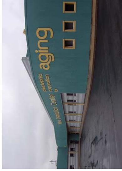
PCA Meal Distribution Center